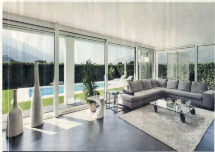
GURGAON LUXURY HOUSING IS ATTRACTING HNIS AND NRIS WHO ARE KEEN TO BUY HERE